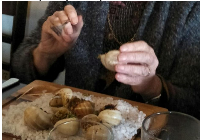
A Galloping Gourmet enjoying snails at the Farmers Arms in Beac