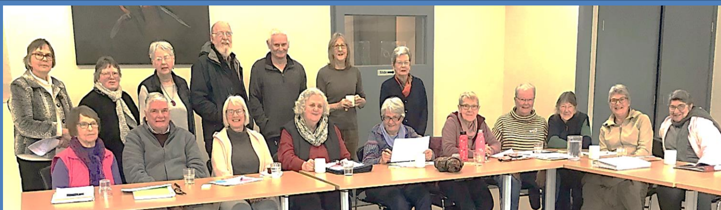
Planning meeting at Kawarren for the Management and Activity Committees

Friday 28th July 10am – 12pm at Kanyana F